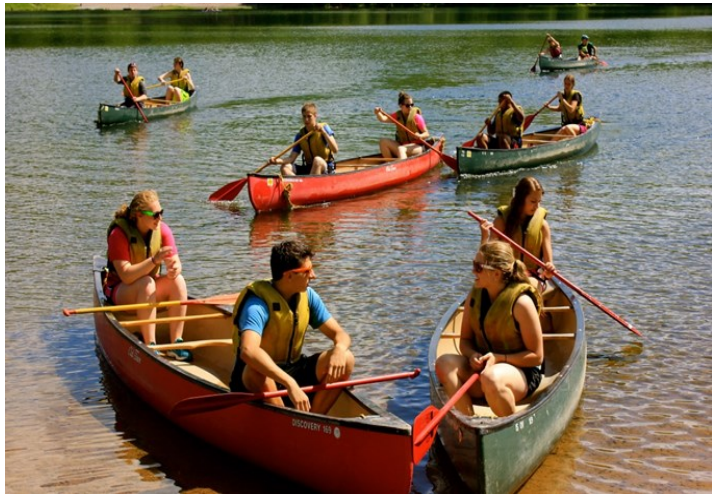
Schuylkill Acts & Impacts participants enjoy removing invasive plants and learning to paddle canoes.